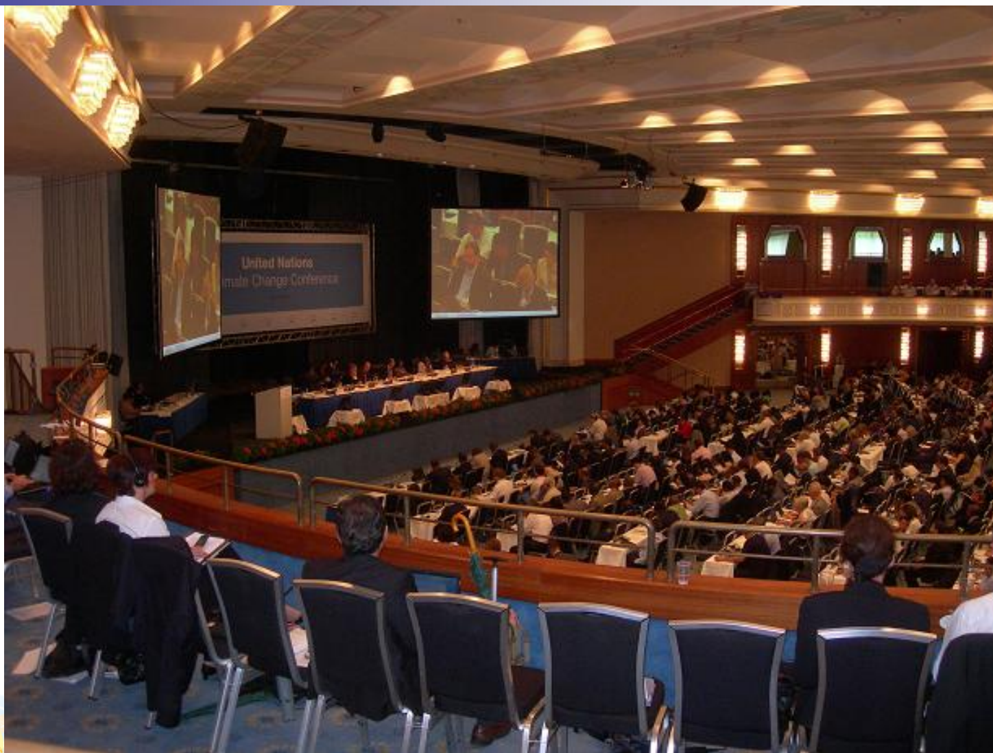
plenary meeting room, Maritim Hotel, Bonn